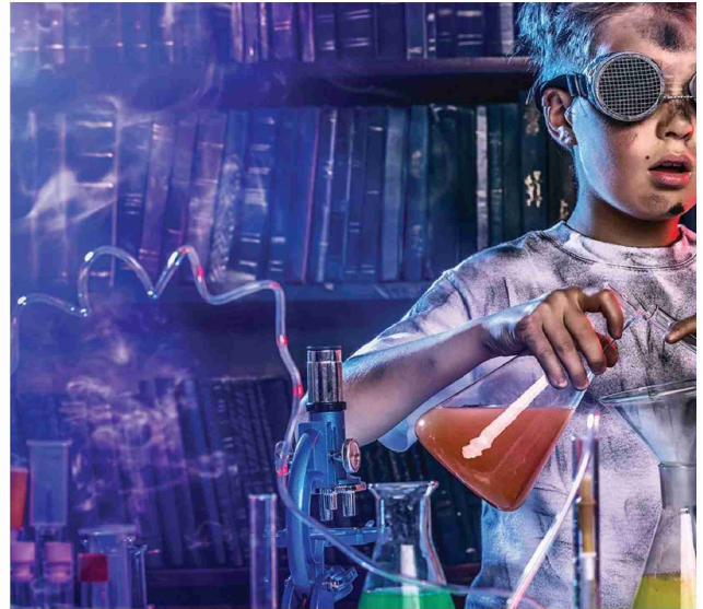
Funderland will have fantasy zones.

Funderland will provide these pupils with free entry into the event, a carnival ride and entry into the Funderland Talent Search and the Mzansi Talent Competition.