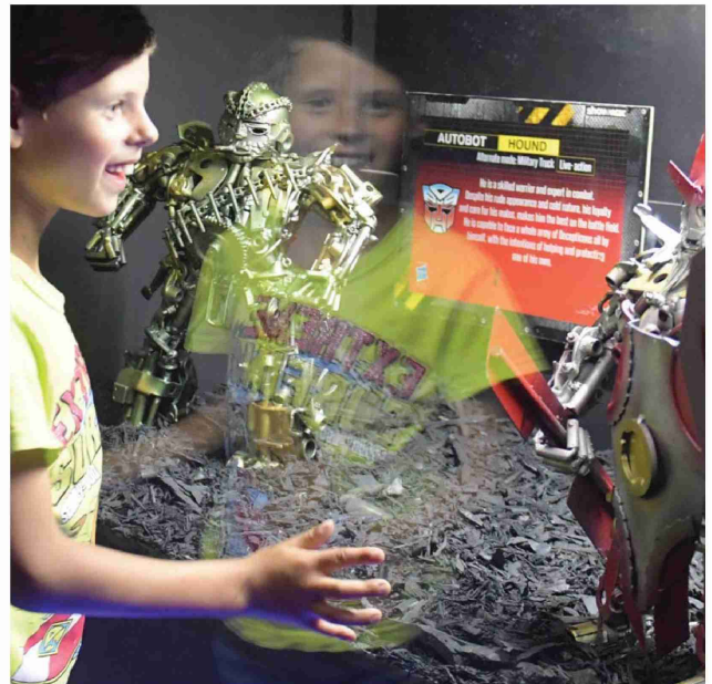
A child stares in awe at a display of Transformers models.