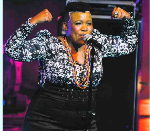
KING THA DAY