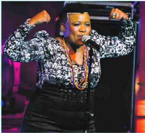
KING THA DAY